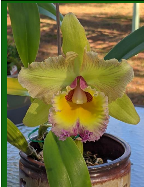
Pam Layne's Newbury Majesty. Bloomed 1 day after last meeting.