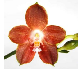
Phal. venosa (AOS pix)

Best In Show Table Standard Size - was Wilsonara Pacific Perspective 'Pacific Heat'.