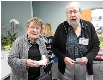
The boss and her boss! Maybe ...!