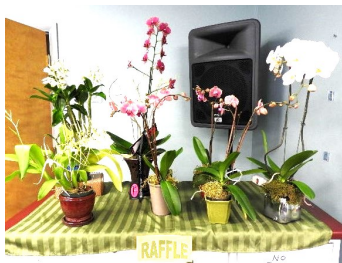
The Raffle plants!