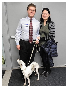
With the dog!