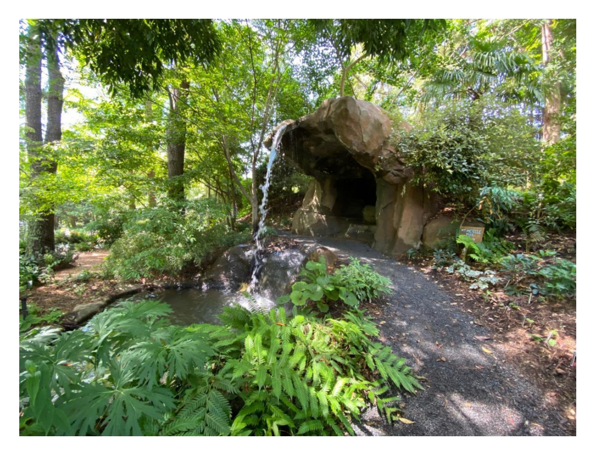
Juniper Level Botanic Garden